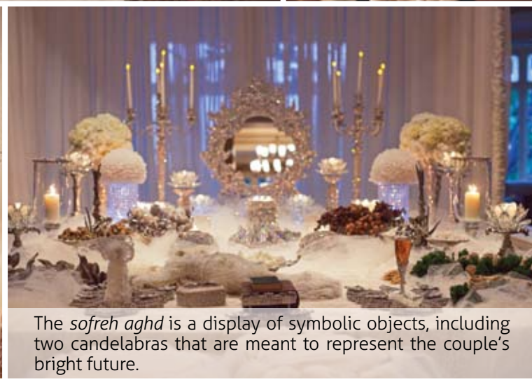
The sofreh aghd is a display of symbolic objects, including two candelabras that are meant to represent the couple's bright future.